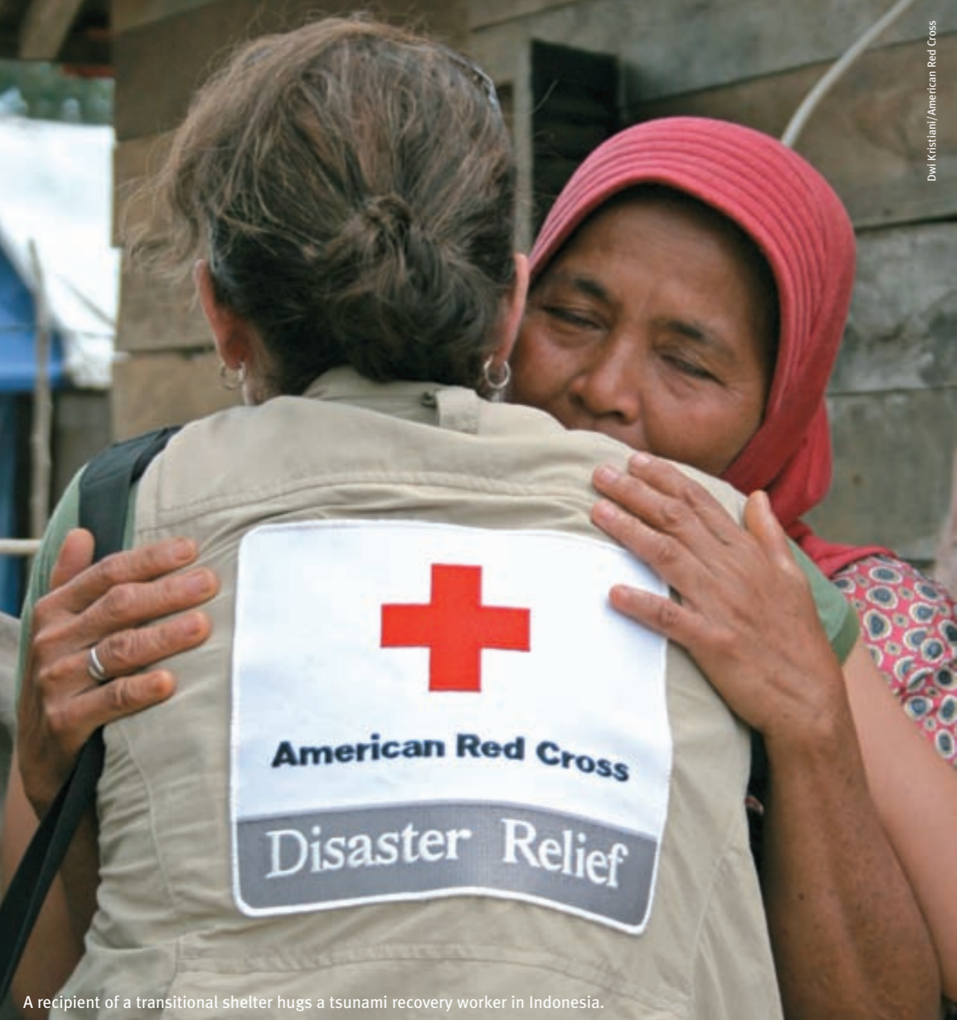
A recipient of a transitional shelter hugs a tsunami recovery worker in Indonesia.