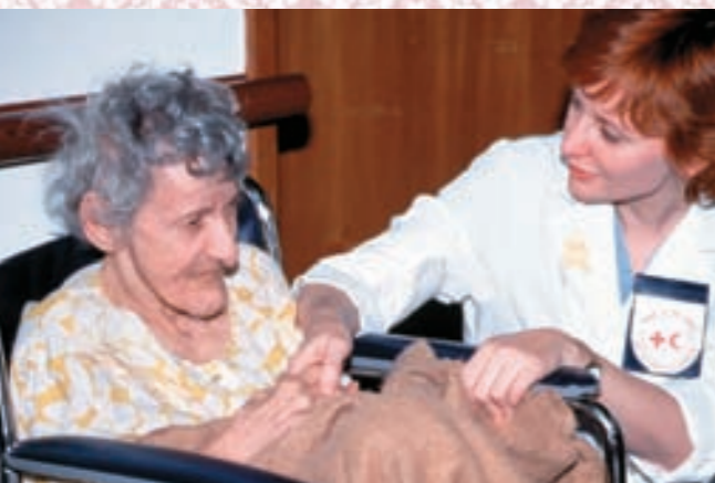
Taking care of the most vulnerable.